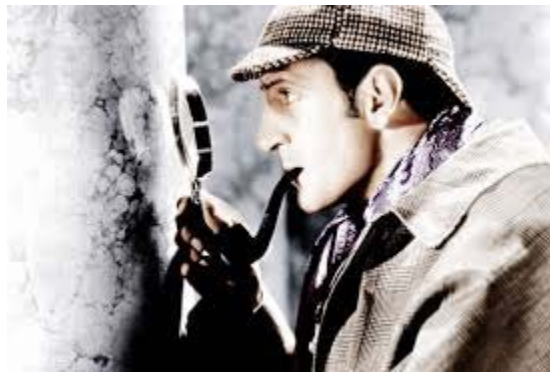
Basil Rathbone as Sherlock Holmes

Here is a note of interest to readers of fiction. Those who have read Sir Arthur Conan Doyle's stories of the fictional detective, Sherlock Holmes, will recall the author's insistence that his hero is engaged in deduction as he uncovers from various clues the identity of the perpetrator of a crime. But Conan Doyle was wrong : what Holmes was engaged in was not deduction at all, but induction . Although Holmes boasted that he could achieve his results with the precision of the mathematician, this was only because the clues to identify the culprit were pre-programmed by his author. In real life forensic work never approaches the certitude that the mathematician can offer.