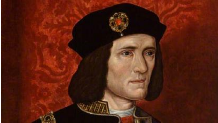
King Richard III

In June 1944 a spirited debate took place between His Royal Highness, King George VI, and the Prime Minister, Sir Winston Churchill. The reluctant inheritor of the throne insisted he should be in the vanguard of the forces about to invade the Continent; that he should be—and be seen to be—the leader of his army in battle. Fearful that the King might be killed, and so soon after the abdication crisis, Churchill had the greatest difficulty in dissuading him.